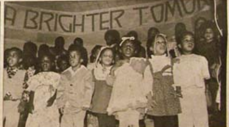
Left, entire OCS student body put their hearts into singing of finale song, "Love Is The Answer."