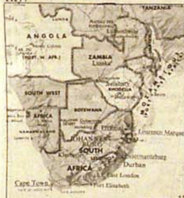
The frontline African state of Botswana has been subject to unwarranted attacks from Rhodesian racists.

The Security Council resolution, approved by a vote of 13 in favor with the U.S. and Great Britain abstaining, also called for an international effort to help Botswana withstand the economic hardships it has experienced due to the need to divert funds from economic development to security.