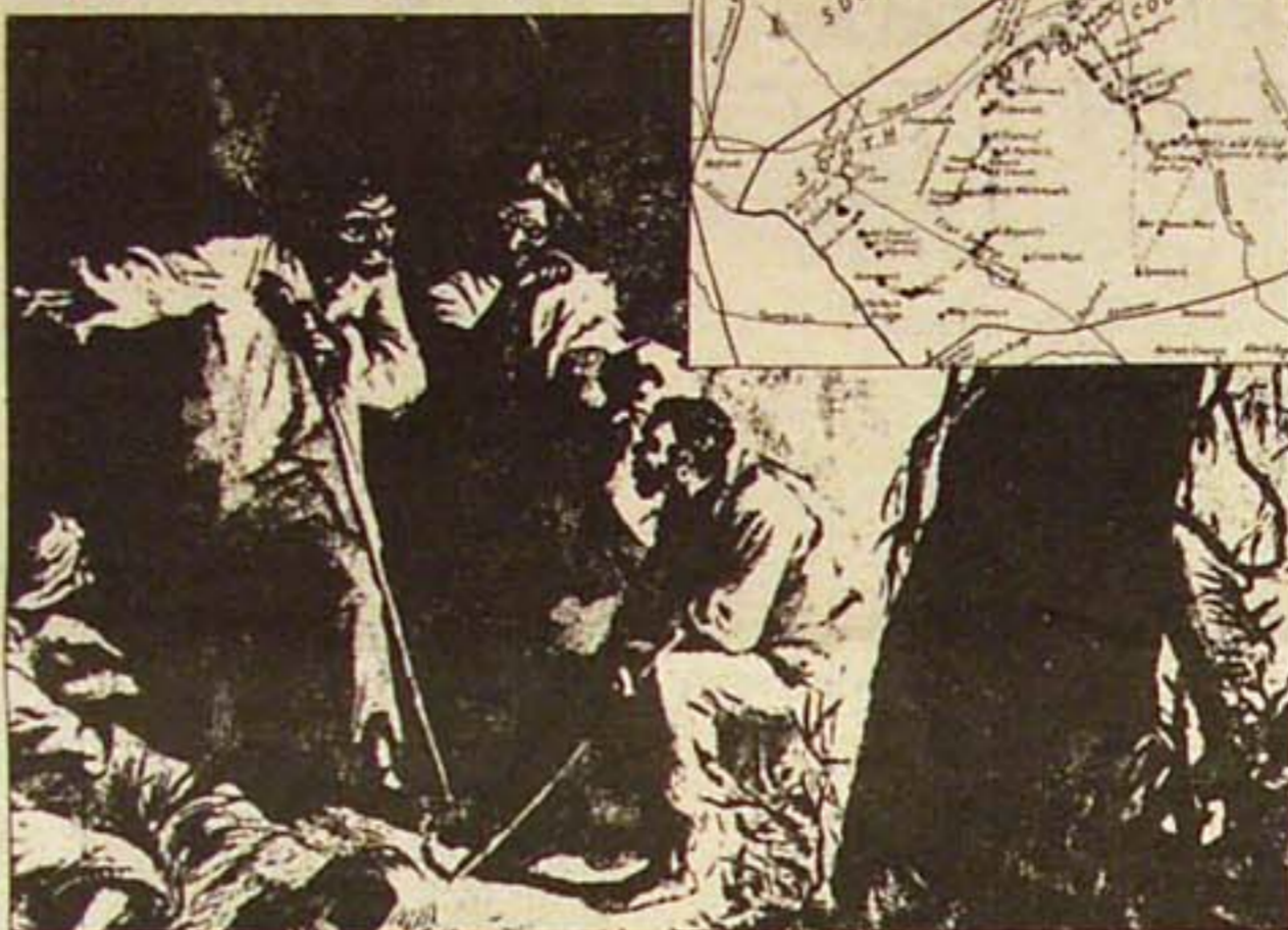
Artist's conception of the planning of the historic slave rebellion in Southampton County, Virginia (map), in 1931, led by the great Nat Turner (center, standing).

No, they know too well, that they would get themselves ruined. Why do they not bring the inhabitants of Asia to be body servants to them? They know they would get their bodies rent and torn from head to foot. Why do they not get the Aborigines of this country to be slaves to them and their children, to work their farms and dig their mines? They know well that the Aborigines of this country, (or Indians) would tear them from the earth. The Indians would not rest day or night, they would be up all times of night, cutting their cruel throats. But my color, (some, not all,) are willing to stand still and be murdered by the cruel