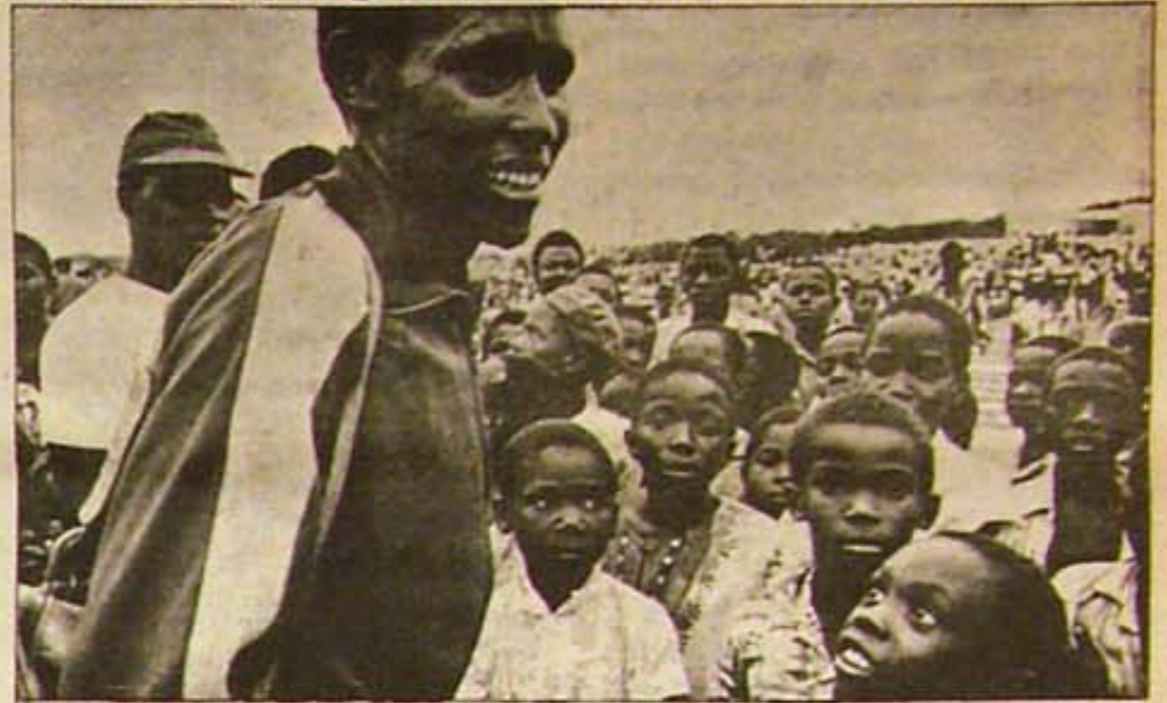
World-class miler FILBERT BAYI greets admiring young people after victory in Tanzanian Olympic qualifying trials.

A New Zealand government official in London confirmed that Muldoon had written the letter. The official stated that New Zealand sports teams would not be encouraged to travel to South Africa but there had been no basic change in his government's position.