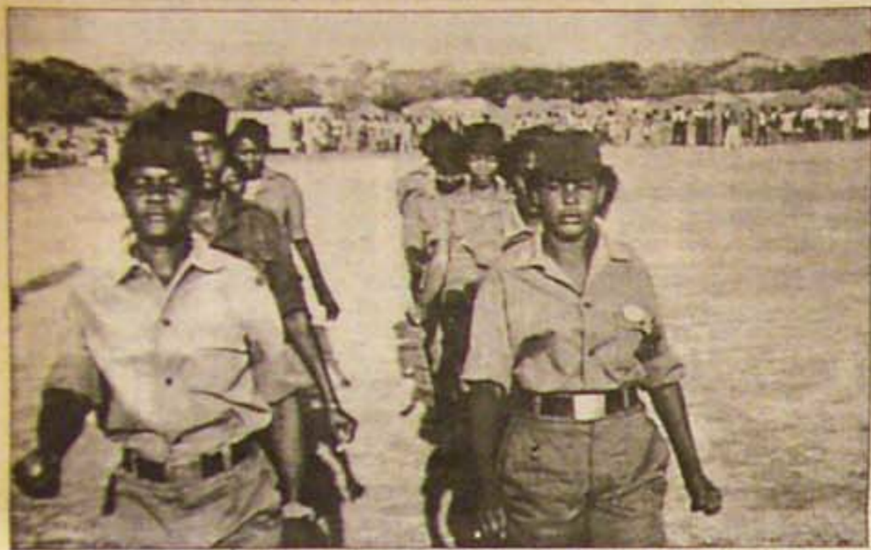
SWAPO women's brigade (above) and youth detachment (right). Formed in 1960, the Namibian liberation movement has developed broad-based people's support.