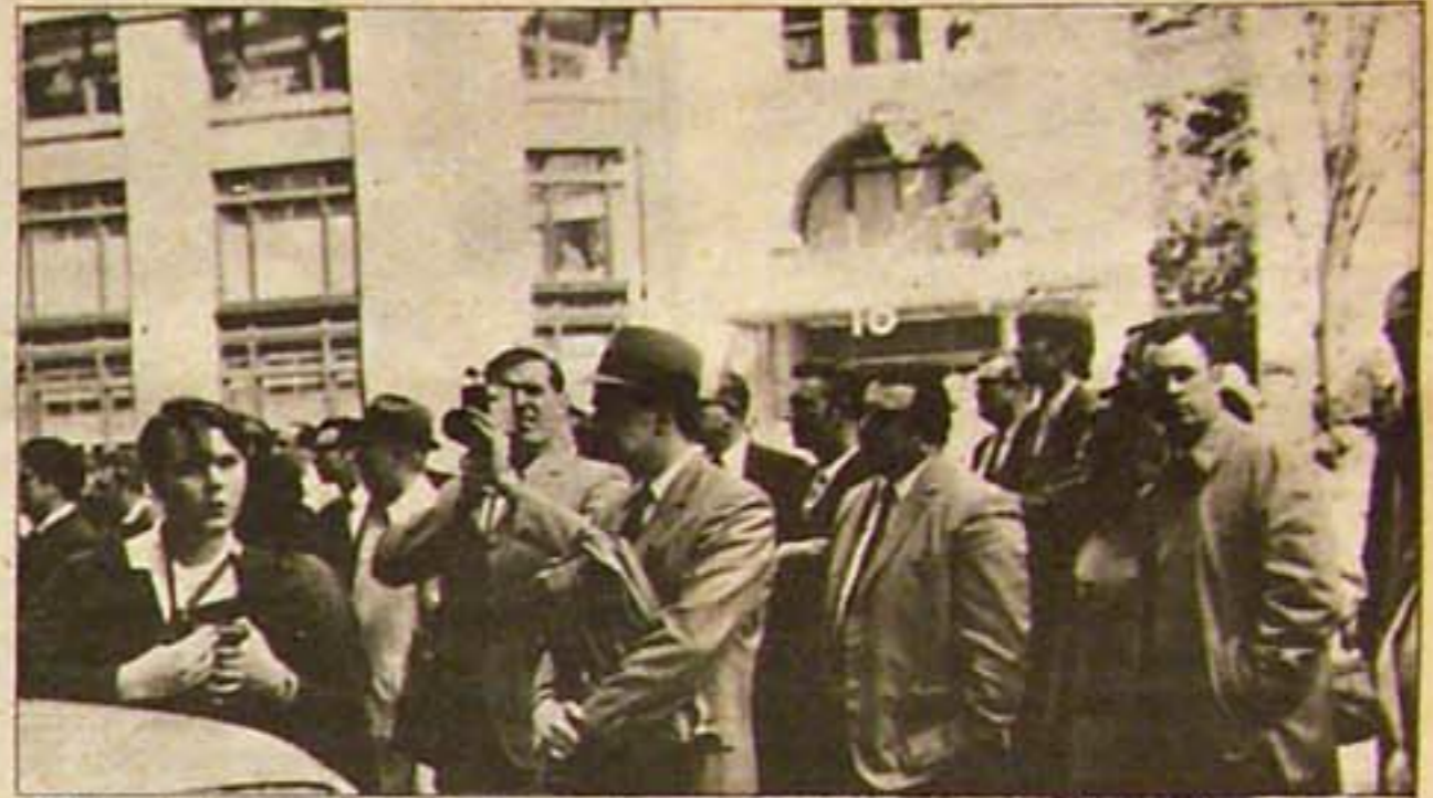
Plainclothes policemen conduct surveillance operation of anti-war protest. Information Digest provides a key link between police and private right-wing groups.

It adds that the Digest "was the string that held together a network of hidden informants whose information was recorded by police departments throughout the nation without the individual involved knowing the process and without independent checking by