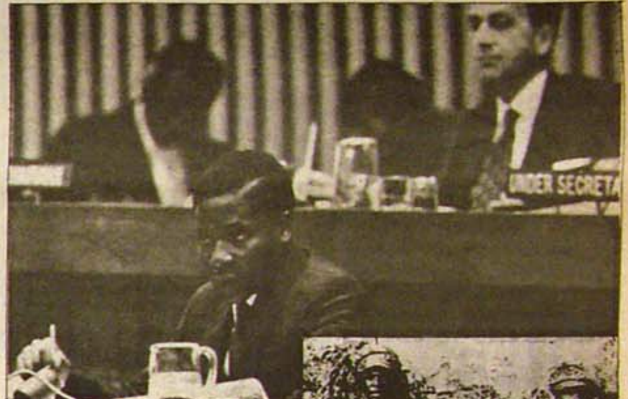
ROBERT MUGABE and Zimbabwe guerrillas (right).

Any encounter with the British negotiator would be a "futile exercise," the two Black leaders said in a statement released here, Reuters reports, signaling the final breakdown in attempts to