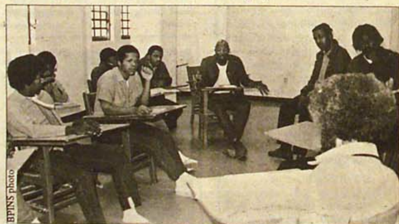
Inmates express their views at recent meeting at San Bruno County Jail.