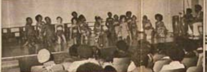
Levels 4-7 girls perform Untshikivo dance (above) and boys present the Isicathulo (Mine Workers) dance (right).