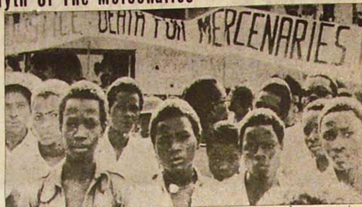
Angolan people demand death penalty for captured mercenaries during last year's historic People's Tribunal.