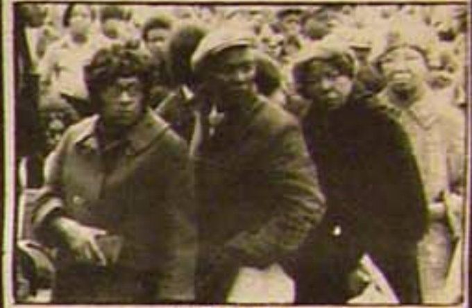
GUEST EDITED BY The Black Panther Party