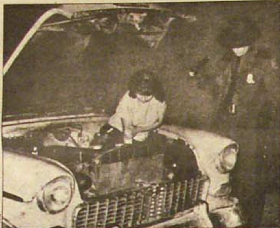
INS border patrol officers force undocumented Mexican woman out from under hood of car at border crossing and (below) frisk "illegal aliens" traveling on freight train.

Medina's ninth deportation hearing, scheduled for January 11, was postponed by the government until February 10.