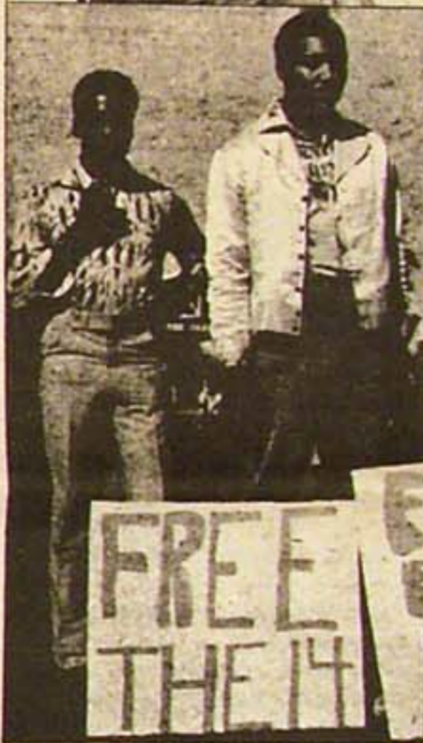
Billboard displaying the Marine Corps' shameless acceptance of KKK activity in its ranks (above) and supporters outside trial of Camp Pendleton 14.

included a cross-burning, open display of KKK insignias by White Marines, attacks by Whites on Black Marines and White enlisted men openly displaying knives which they referred to as "nigga stickers."