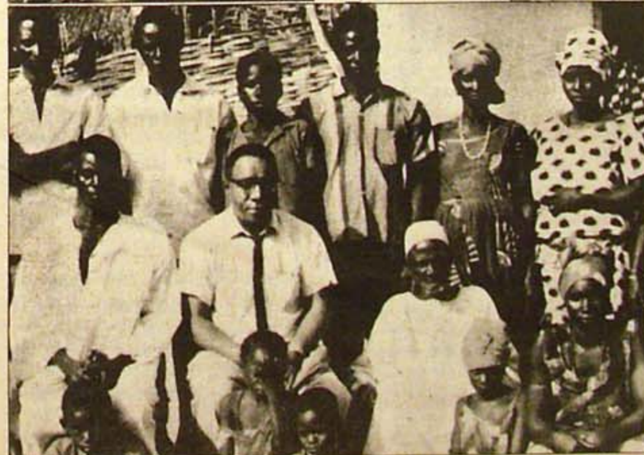
Author ALEX HALEY with distant cousins in The Gambia, West Africa. Above, KIZZY, played by Leslie Uggams.