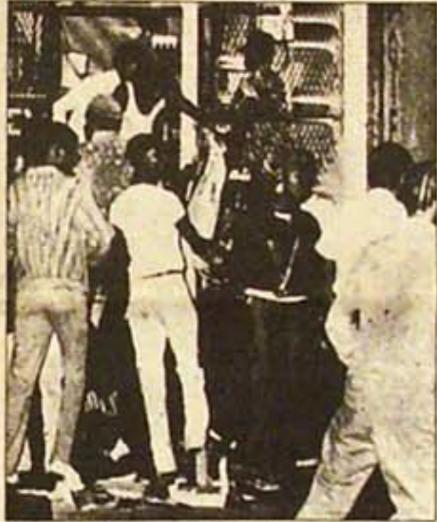
Illegal spy operation set up under former President Johnson was aimed at crushing Black uprisings, as in Baltimore, above.

Christopher, who was deputy attorney general under Johnson, Secretary of State Cyrus Vance, HEW (Health, Education and Welfare) Secretary Joseph Califano and Carter's unsuccessful nominee for CIA director, Theodor (Ted) Sorenson, were all involved in an intelligence operation under the Johnson administration that was aimed at