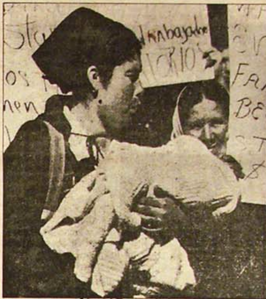
Mother and baby participate in rally of several hundred migrant farm workers at Miami's Federal Building to demand relief as freezing weather has forced them out of work.

Their wages do not enable many to meet weekly housing and