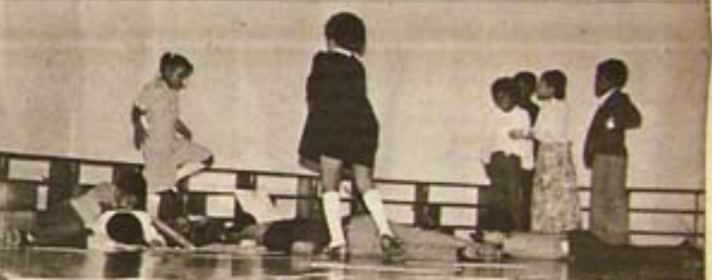
Scenes from original OCS play A Brighter Tomorrow : (top photo) Children in Soweto classroom decide to boycott schools in protest of forced use of Afrikaans language; (middle photo) Boycott scene in the streets of Soweto; and (above) protesters shot down by South African police.