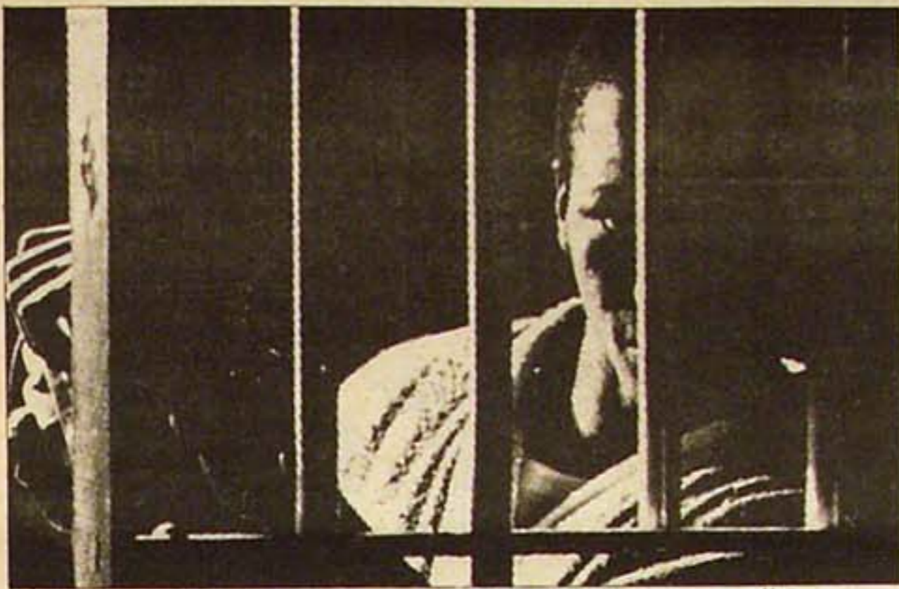
Black inmate looks out from lonely prison cell.