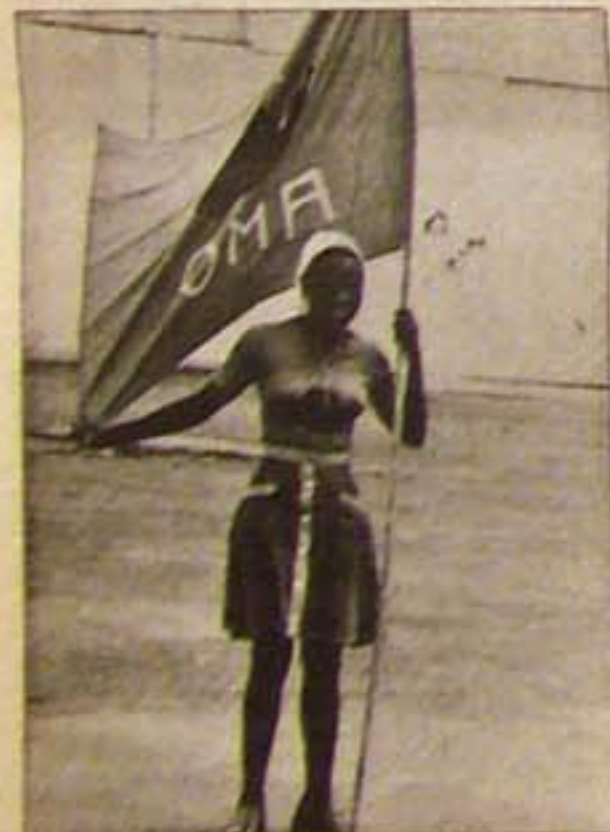
Young militants of the Popular Movement for the Liberation of Angola (MPLA).

Since the victory of MPLA in Angola the struggle in Namibia has reached a much, much higher level. The guerrillas are operating not from bases abroad but from stations inside Namibia, not only in remote, hidden bush camps but among the population, launching operations right from within urban and industrialized areas throughout the country. □