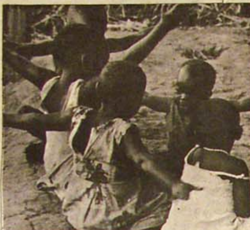
Young children play in model Tanzanian day care center that frees their mothers to participate in production.

Chrysologus said the money raised by the cash crops is reinvested in community pro-