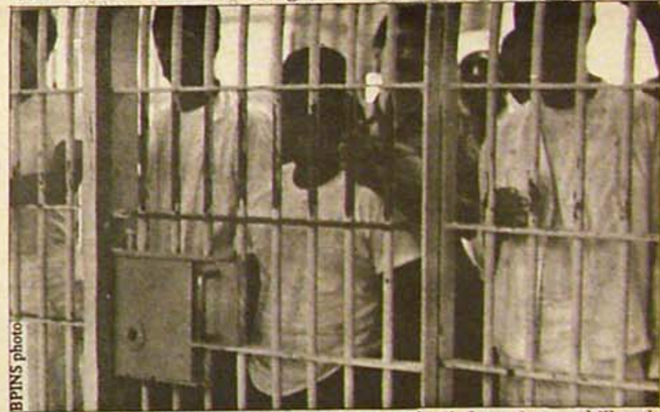
Black inmates are railroaded into prisons and jails by unjust and illegal court proceedings.

Gethers stated that he was "down but still swinging." □