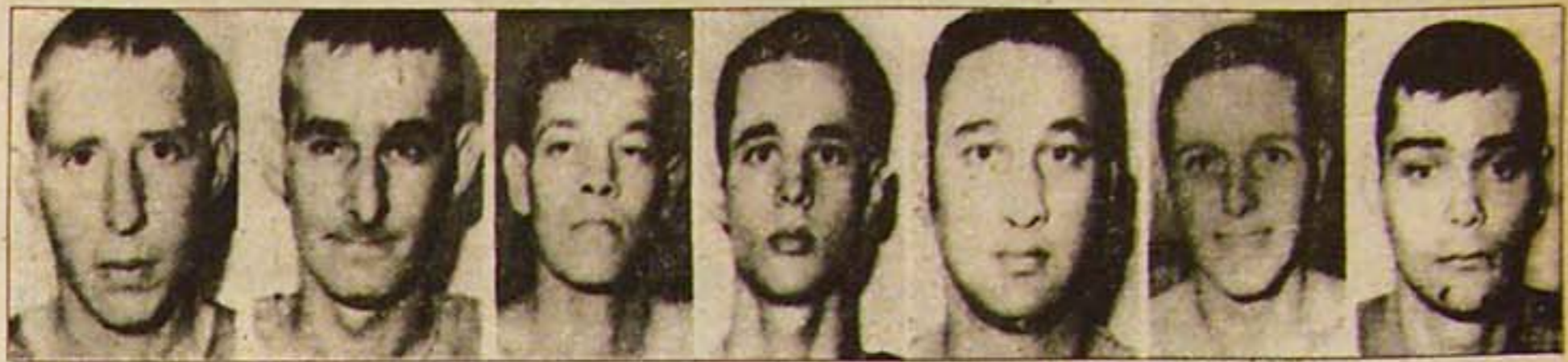
"SCUM OF HUMAN SOCIETY" CONDEMNED AT HISTORIC TRIAL

"Let the whole world hear the powerful voice of universal labor that demands that South Africa