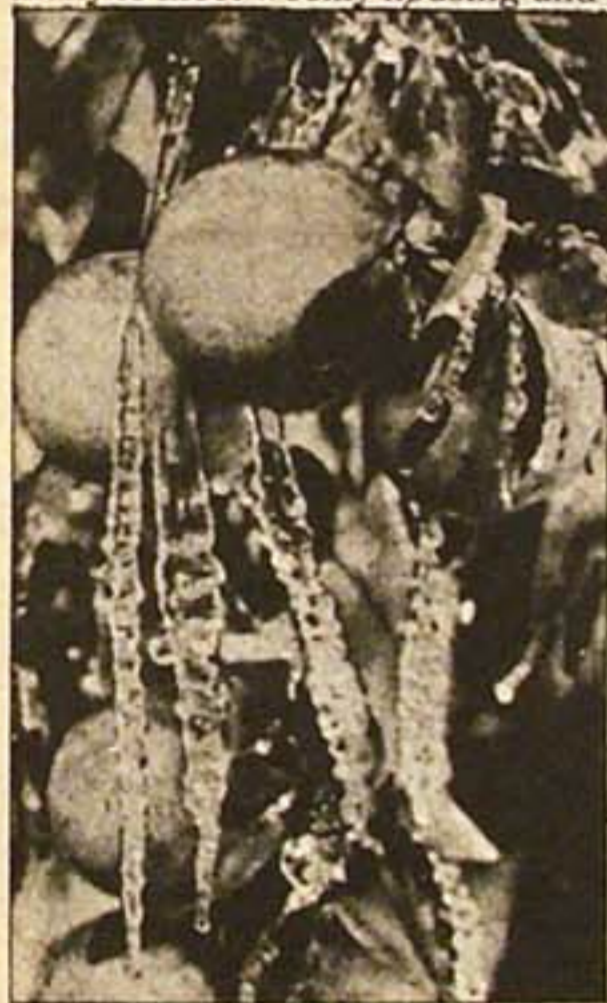
Ice clings to oranges in a Florida fruit grove. Bitter cold has destroyed millions of dollars worth of crops and has put hundreds of thousands out of work.

The diversion of natural gas supplies from the factories to the homes may have prevented widespread disaster. Yet many poor families' homes are still without heat anyway. According to energy analysts an average home will be paying $236 more for their oil and natural gas supplies than it did last winter.