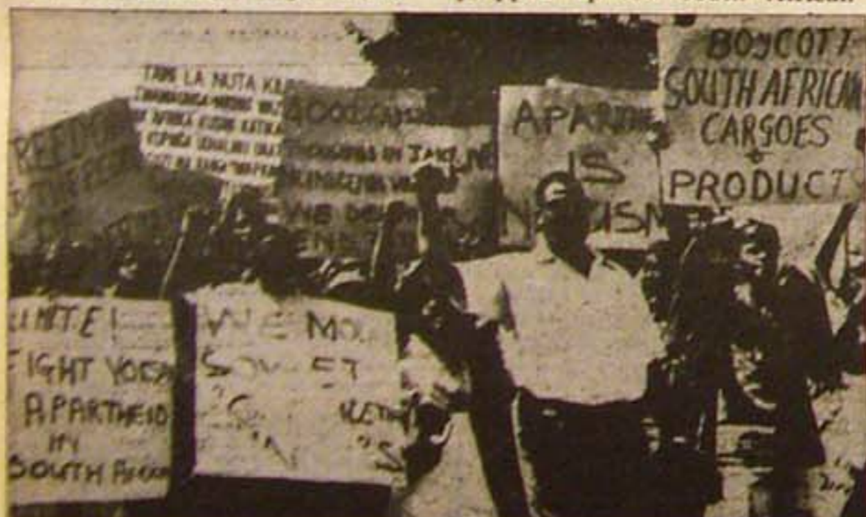
ARON PEMBA (in white shirt), head of South African Congress of Trade Unions, leads Tanzanian workers in march against apartheid.

"The abolition of this law is unacceptable and would lead to serious social troubles," said Botha, adding that "the government will not budge from its policy of non-recognition of Black unions." □