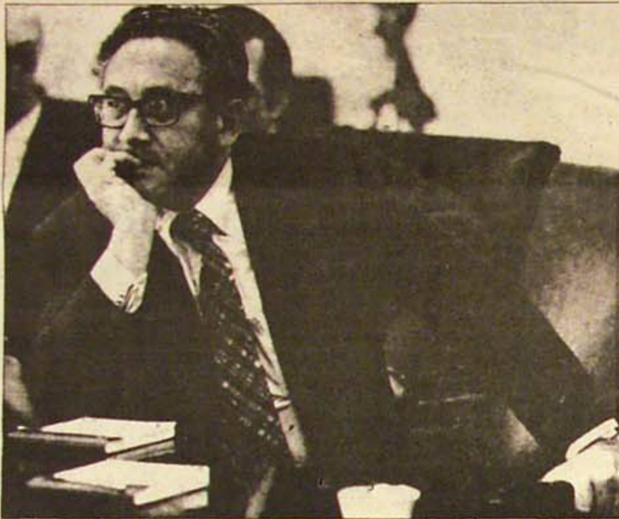
Former Secretary of State and National Security advisor HENRY KISSINGER, through his "shuttle diplomacy," constantly sought to bolster sagging U.S. domination around the world.

Hundreds of thousands of Vietnamese, Cambodians and Laotians were killed or wounded, while millions of people were uprooted by the rain of bombs from U.S. aircraft. Homes, crops,