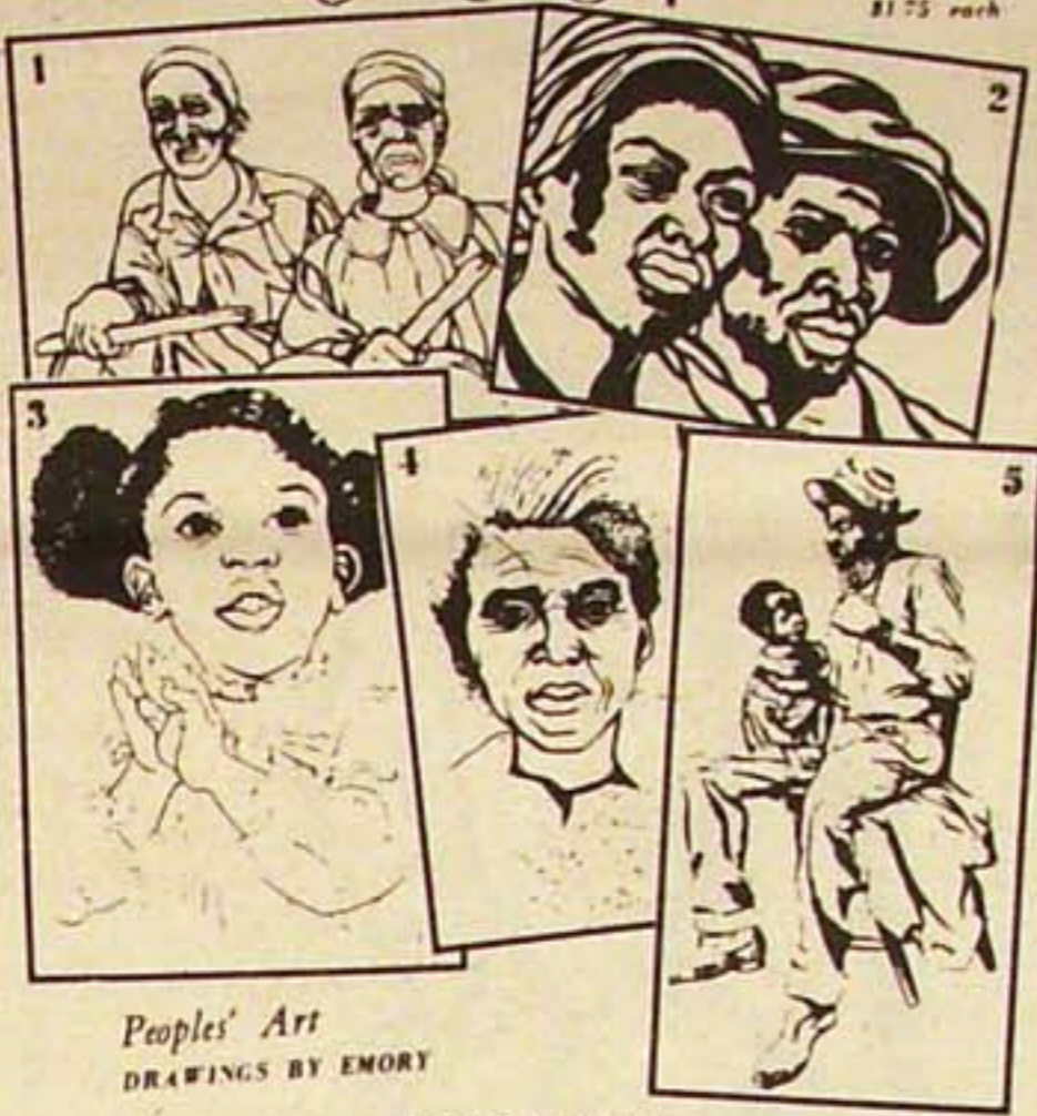
Peoples' Art DRAWINGS BY EMORY

OUTSIDE UNITED STATES: $4.50 per package $1.75 each