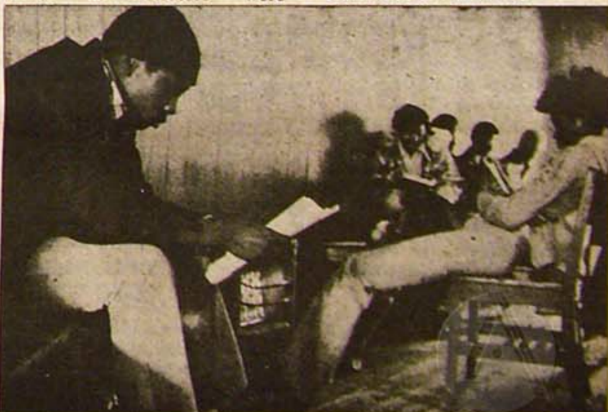
Calhoun County, South Carolina, students study in makeshift classroom during their nine-week school boycott.