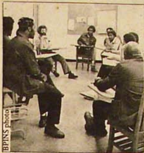
Recent BLACK PANTHER interview at San Bruno County Jail.

This and other incidents, says a statement issued by the defense committee, "show the seriousness of racist attacks and harassment going on at Camp Pendleton. The collusion between the Marine Corps command and the KKK is clear. The Marine Corps brass bears full responsibility for these and any further racist attacks." □