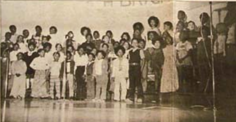
Left, children of Levels 1-3 sing "Ibandengeiami." Above, "Kusile" ("Come To Me, Let's Be Friends") is sung by children of Levels 4-7.