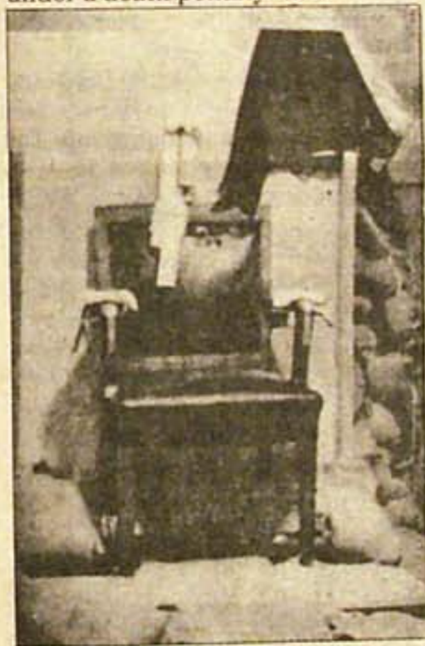
Chair in which Utah Death Row inmate Gary Gilmore was executed by a firing squad. Note Black hood (draped over partition) which covered Gilmore's head during the execution.