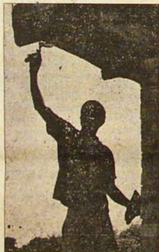
A house under construction in model Tanzanian village of Chamwino.