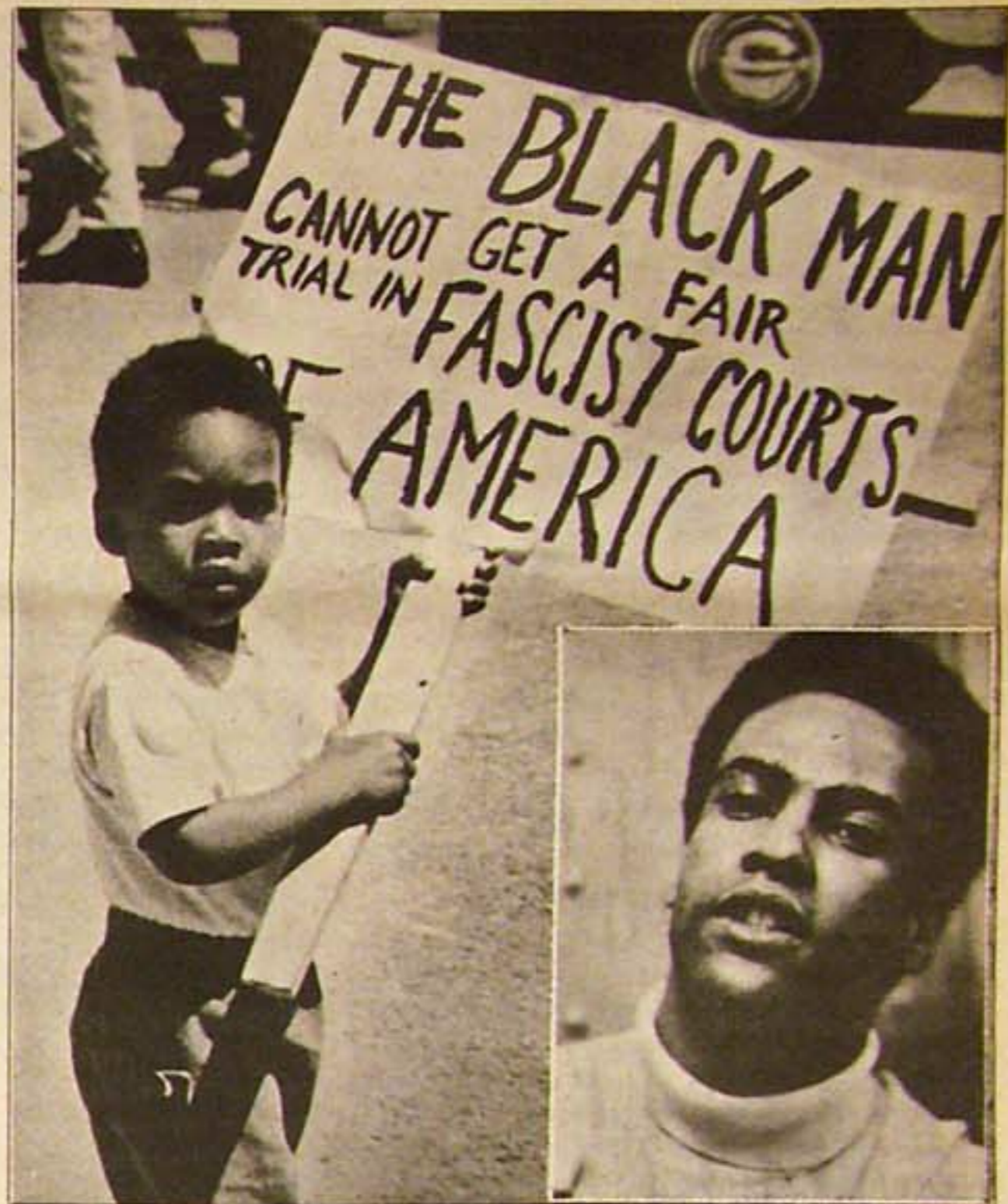
During his 1968 murder trial, HUEY P. NEWTON (inset) detailed in his testimony the racism and oppression faced by Black Americans.